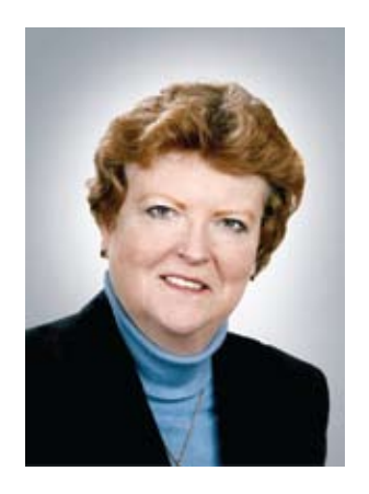
USA, West Virginia West Virginia Department of Insurance