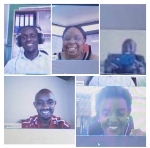
Some of the Rwandan team members