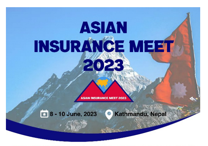
"BUILDING RESILIENCE IN INSURANCE TOWARDS EMERGING RISK"

For more information, visit the event website.