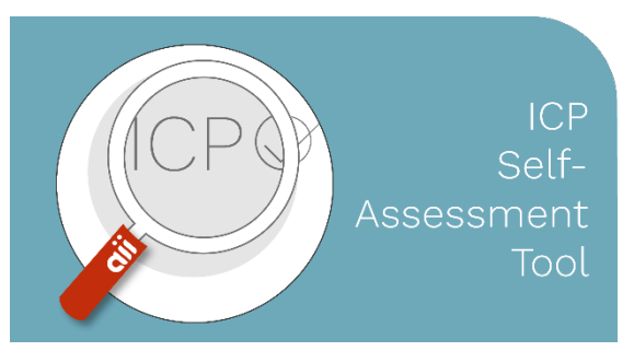
Have you tried the SAT tool yet? The Insurance Core Principles Self-Assessment Tool is a joint